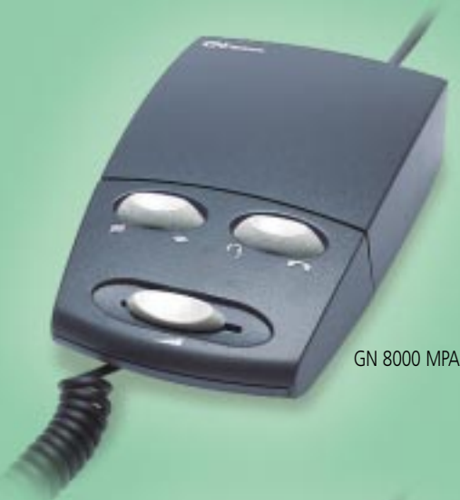
GN 8000 MPA