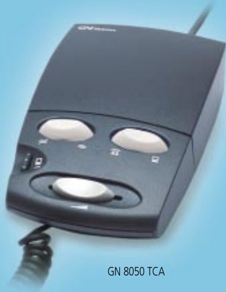
GN 8050 TCA