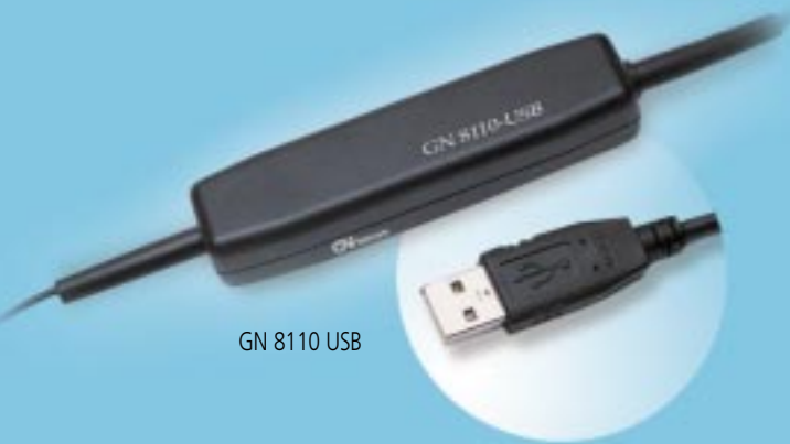
GN 8110 USB

For speech recognition or CTI, sound quality is critical. So whatever the need, choose GN Netcom, the world leader in sound quality.