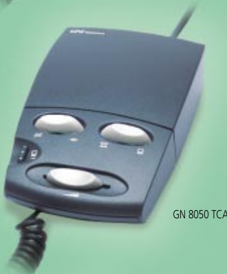
GN 8050 TCA